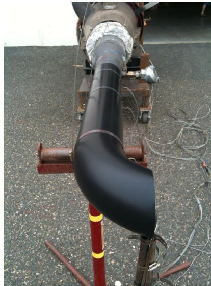
Figure 1. A class 8 exhaust stack was coated with Cerakote™ C-7400 SC and tested to determine the durability, performance, and thermal barrier capabilities at elevated temperatures.